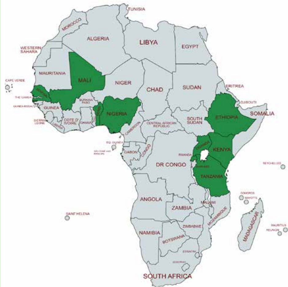
EOA Initiative Coverage