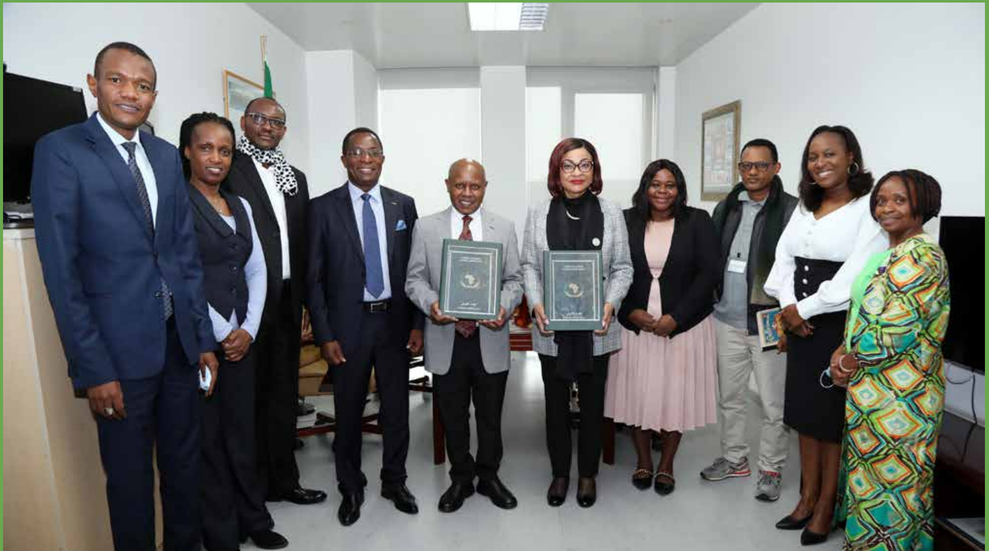
The African Union (AU), on behalf of the Specialized Technical Committee (STC) on Agriculture, Rural Development, Water and Environment, signed an MoU with Biovision Africa Trust (BvAT) in July 2022 endorsing BvAT as the EOA Initiative's Continental Secretariat. Under this role, EOA Continental Secretariat hosted by BvAT serves as the official agency to oversee the implementation and reporting the progress of the implementation of the AU's decision on ecological organic agriculture.