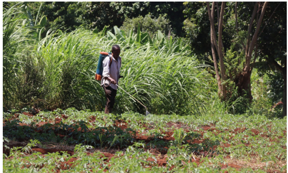
A tomato farmer in Kirinyaga, applying synthetic pesticides without the use of personal protective equipment

https://infonet-biovision.org/AnimalHealth/Animal-nutrition-and-feed-rations