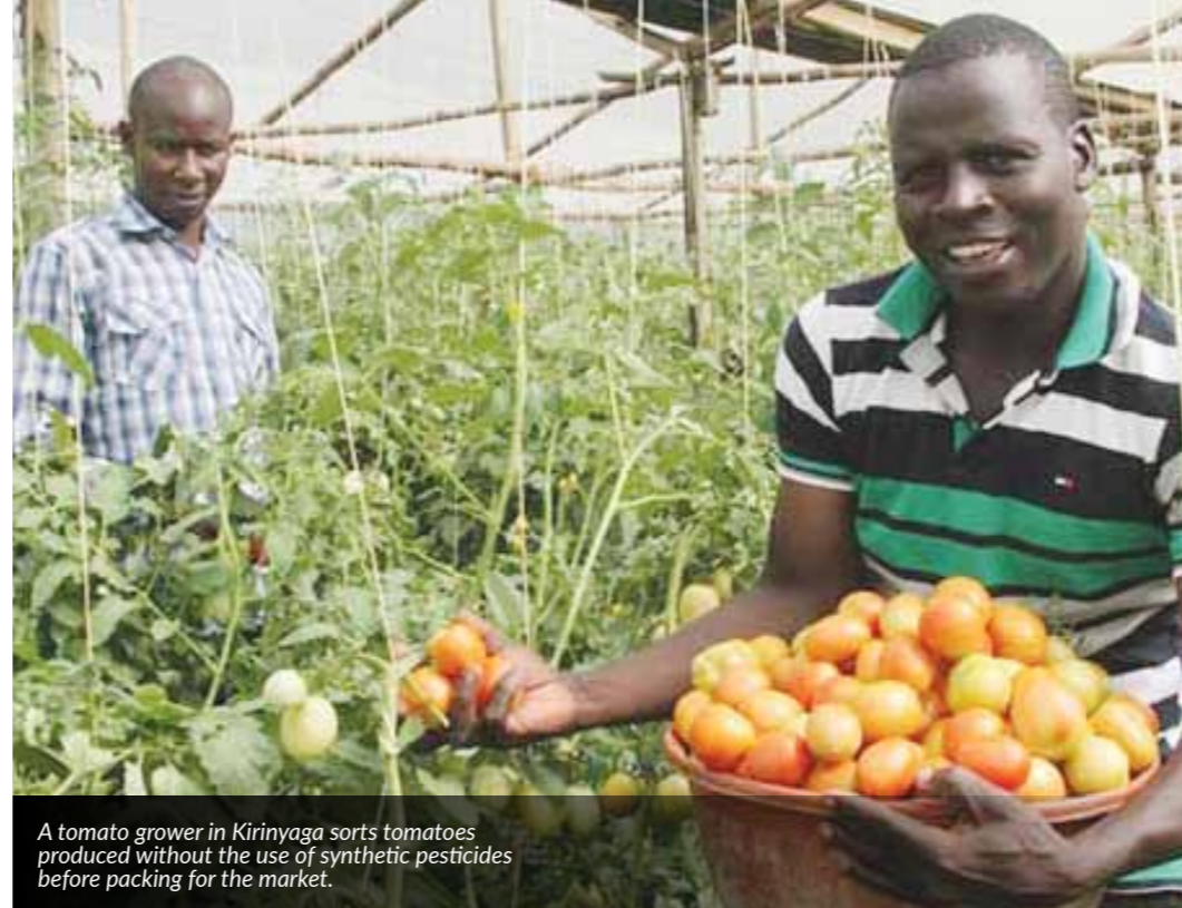
A tomato grower in Kirinyaga sorts tomatoes produced without the use of synthetic pesticides before packing for the market.

Overwhelmed by the devastating effects of the pest, tomato growers have responded by spraying their crop with anything and everything they think will kill the damaging caterpillars which eat the inside of leaves forming mine-like patches that result in the death of leaves. The pest also affects flowers, stems, and tomato fruits. In most cases, farmers have been forced to abandon their crops due to extensive damage. At first, some of the chemicals produced spectacular results but now they have been reduced to ineffective pesticides as they seem to have lost their effect on the pest. This is because Tuta absoluta has developed resistance and most pesticides are no longer as effective as they used to be. The chemicals in harvested tomatoes are worsened by traders or middlemen who buy the tomatoes directly from farmers and sell them to markets in Nairobi. The traders insist that the farmer