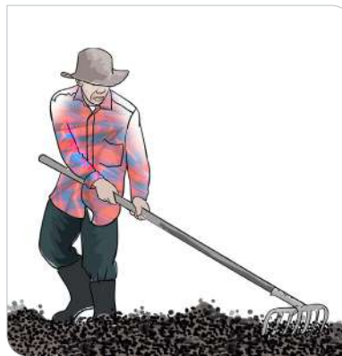
Use a rake to level your planting beds