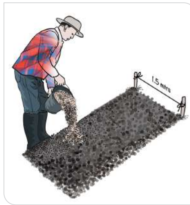
Mix your soil with manure