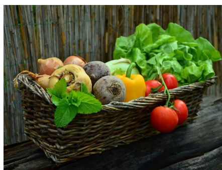
Figure 1: Aldridge, S. M. (n.d.). Eating the Rainbow. Retrieved from https://hemaware.org/mind-body/eating-rainbow