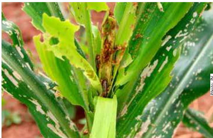
A maize plant destroyed by fall armyworm larvae

Mature larvae vary from light tan or green to nearly black. They have three yellow-white hairlines down their backs. On each side and next to the yellow lines is a wider dark stripe. The moths have a wingspan of 32 to 40 mm. They have dark grey, mottled (coloured spots) on the forewings with light and dark splotches (marks), and a noticeable white spot near the extreme end of the worm.