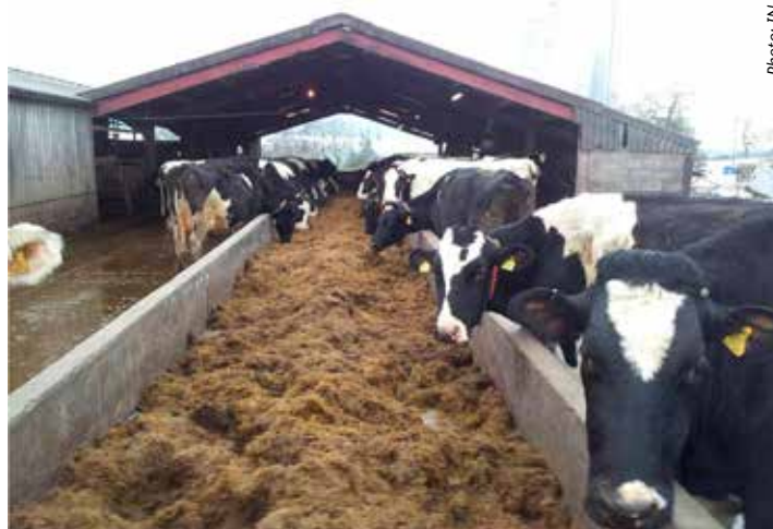
Toxin binders protect feed from aflatoxins

Aflatoxins are the most common fungi in the family of mycotoxins, which grow on cereals such as maize, beans, groundnuts wheat sorghum or millet. The fungi develop when