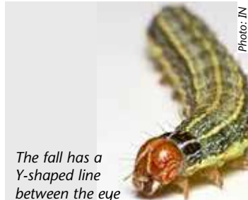
The fall has a Y-shaped line between the eye

To differentiate this larva from other armyworm species, one needs to look at the head of the insect. The fall armyworm's head has a predominantly white, inverted Y-shaped suture between the eyes. Young larvae are greenish or brownish in colour and smooth-skinned.