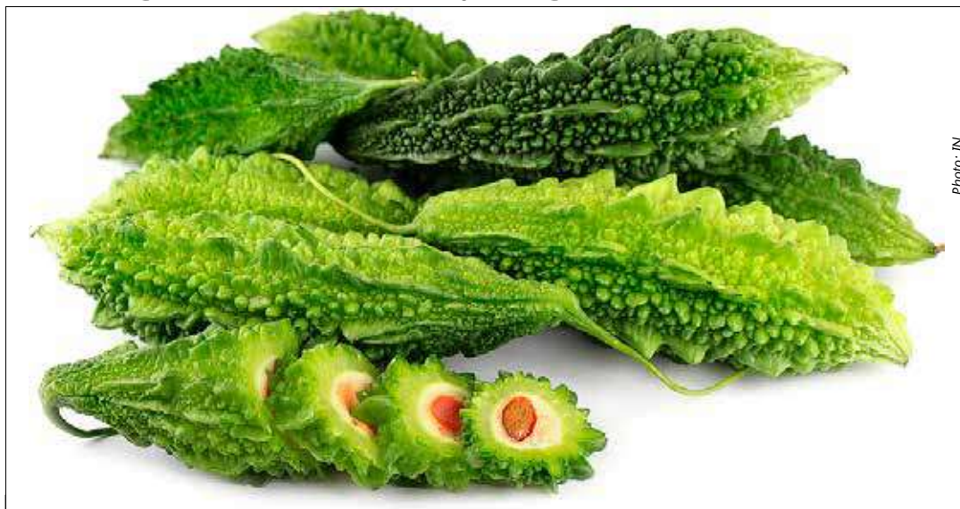
Eating bitter melon improves human health

In immature vegetable form, bitter melon is also a good source of nutrients including Vitamin A which promotes growth, boosts the immune system, reproduction, and improved vision, vitamin C which helps the body to make collagen, an important protein used to make skin, cartilage, tendons, ligaments, and blood vessels. Vitamin C is also needed for healing wounds, and for repairing and maintaining bones and teeth. It also contains iron, which is important in red blood cells (haemoglobin) and muscle cells (myoglobin). Haemoglobin is essential for trans-