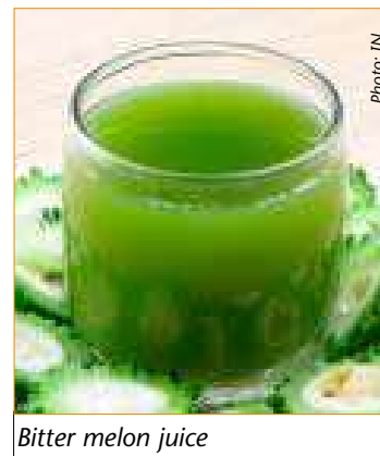
Bitter melon juice

Pregnant women, those who are trying to become pregnant,