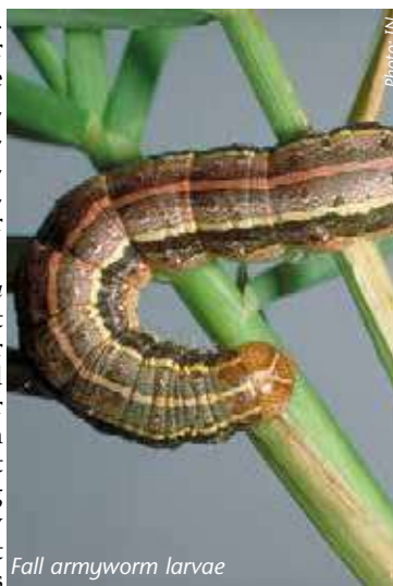
Fall armyworm larvae

The feeding takes between 10 to 21 days after which the larvae changes into pupae stage. A female can lay between 1,000-1,500 eggs. During the larvae stage, which is also the feeding stage, the worms move in the ground like an army, searching for food. Hence, the name armyworm. The worms become very destructive at the larval stage.