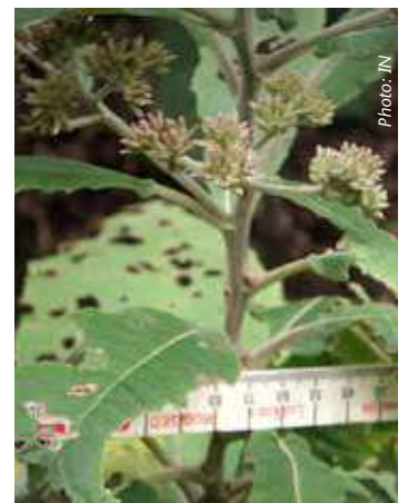
Vernonia Auriculifera ( muthakwa )