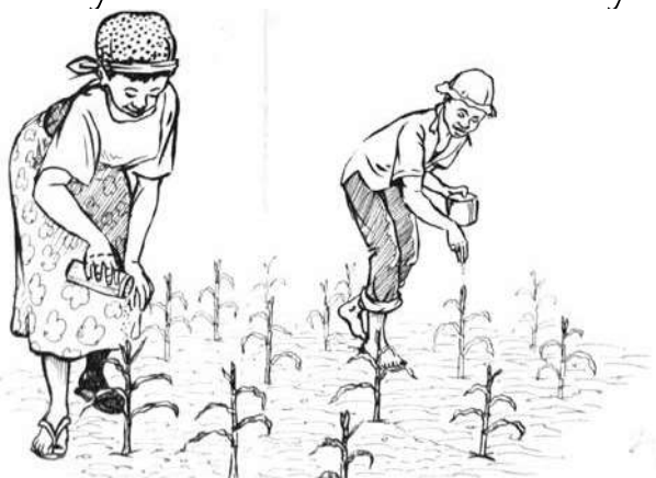
How to apply and chili powder