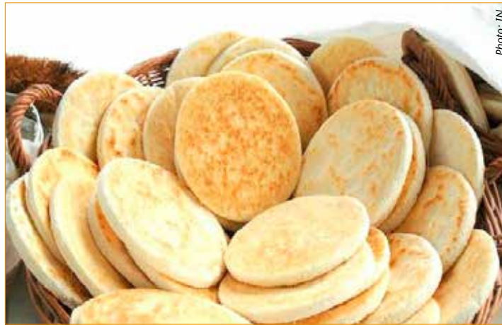
Biscuits made from cassava flour

Cassava tuber is rich in the B-complex group of vitamins such as folates, thiamin, pyridoxine (vitamin B-6), riboflavin, and pantothenic acid. It is a good source of some essential minerals such as zinc needed for the body's defensive system to work properly. It plays a role in cell division, cell growth, wound healing, the breakdown of carbohydrates and for the senses of smell and taste. The magnesium in cassava also helps to maintain normal nerve and muscle function, supports a healthy immune system, keeps the heart beat steady, and helps bones remain strong. The copper in the tuber works with iron to help the body form red blood cells, helps keep the blood vessels, nerves, immune system, and bones healthy. Iron is found in haemoglobin which is essen-