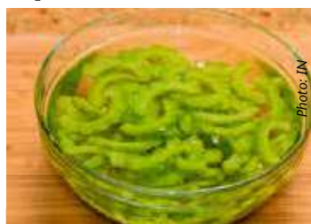
Bitter melon salad

In immature vegetable form, bitter melon is also a good source of nutrients including Vitamin A which promotes growth, boosts the immune system, reproduction, and improved vision, vitamin C which helps the body to make collagen, an important protein used to make skin, cartilage, tendons, ligaments, and blood vessels. Vitamin C is also needed for healing wounds, and for repairing and maintaining bones and teeth. It also contains iron, which is important in red blood cells (haemoglobin) and muscle cells (myoglobin). Haemoglobin is essential for trans-